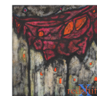
Redshift X 10th Anniversary Collection