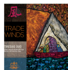
Tiresias Duo Trade Winds