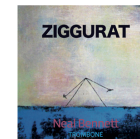
Neal Bennett Ziggurat