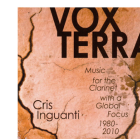
Cris Inguanti Vox Terra