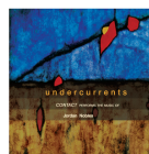
CONTACT Undercurrents: The Music of Jordan Nobles