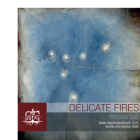
Tiresias Duo Delicate Fires

For more information visit - www.redshiftmusic.org